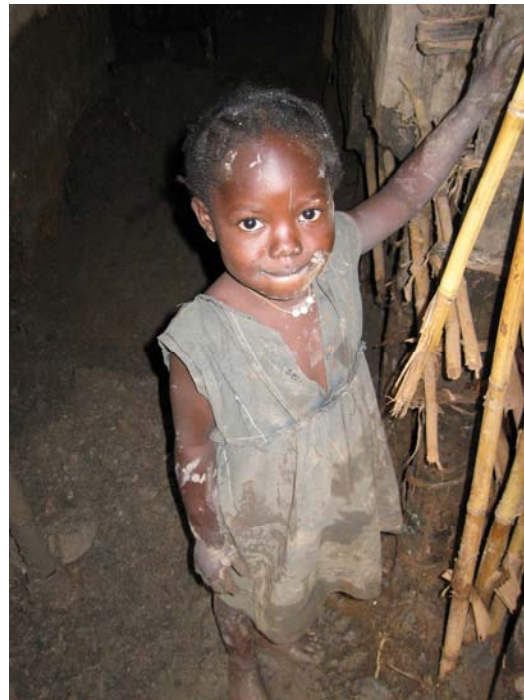
One of the 52 children from our nursery poses in her home after it was flooded by heavy rains.

Helping Uganda's poorest to help themselves