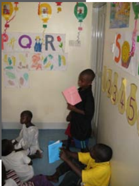
One of our sponsored children reads to his peers during the Saturday Reading Club

The Saturday Reading Club has become integral part of the services we offer for our sponsored children. Because the majority of our sponsored children have never previously been to school they