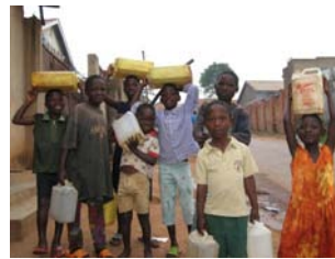
A group of children on their way from collecting water.

from the slum who have never been to school with the opportunity to go to school and receive a quality education and a chance at a brighter future. We