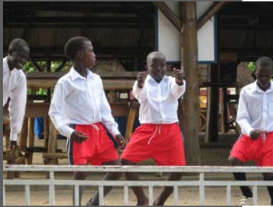
A group of the boys perform a dance during the dance competition.

As a part of the sponsorship programme we also offer a Holiday Programme for the children when they are on break from school. A blend of a variety of activities, such as art, singing, dancing, craft making and modeling, the Holiday Programme is an opportunity for the children to be creative and express themselves. The Programme