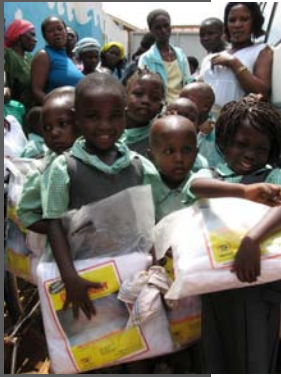
Children from the nursery pose for a photo after receiving mosquito nets from Uganda Hands for Hope.

Our sponsorship programme began in January 2008 with one supporter committing to sponsoring 100 children from the slum to go to primary school. Since then, many other supporters have come forward to sponsor children in primary school and in nursery. More than just providing an education, sponsoring a child also provides them with a school uniform, two meals a day, and an opportunity for the children to interact and develop friendships with